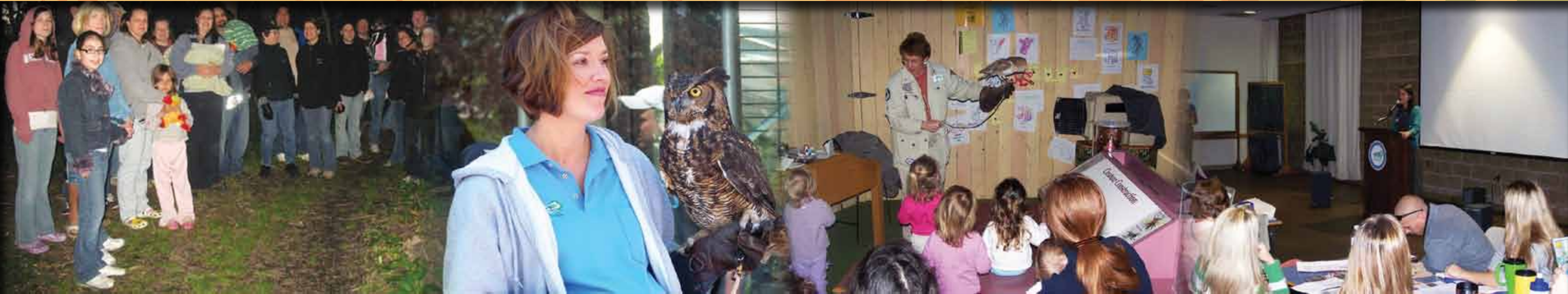
The Buffalo Zoo developed a program for training citizen scientists.

The Buffalo Zoo's programs would not be as successful without the support of the Zoo's volunteers. In 2009, the Zoo's 811 volunteers, including the 115 docents, dedicated a total of 33,231 hours to support the Buffalo Zoo and conservation education.