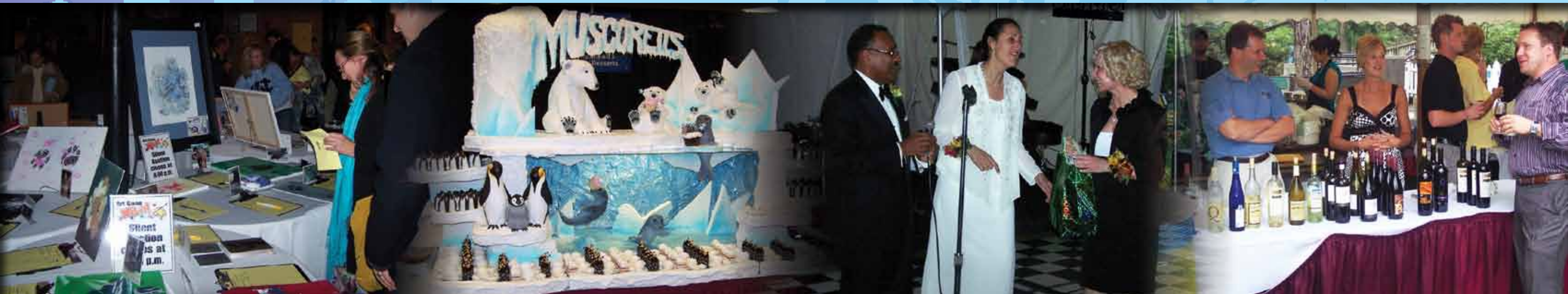
The sixth Art Gone Wild event was a big success!

This year, a new holiday promotion was launched to benefit the Adopt an Animal program. For $25, a holiday animal adoption package was offered that included a collectible, limited series ornament, a special holiday adoption certificate and two guest passes to visit the Zoo. Only 250 of the custom ornaments were minted, and a new ornament will be featured each year in the series.