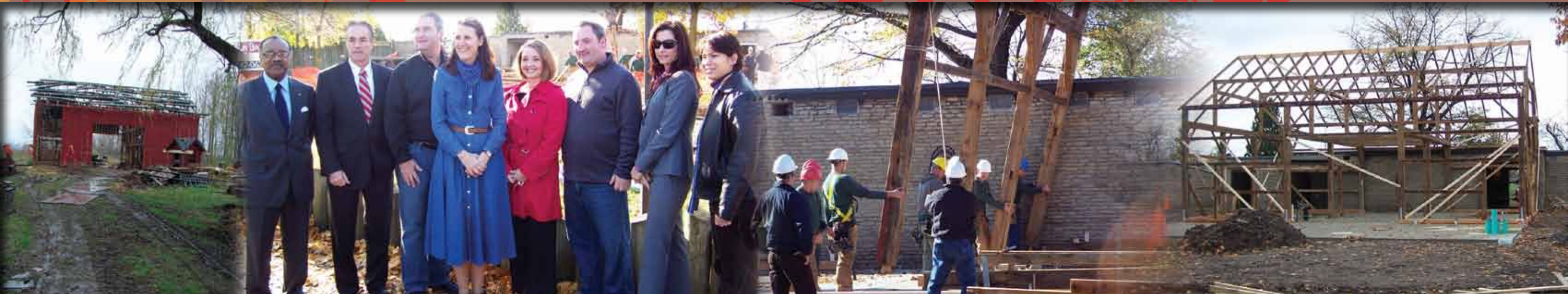
The barn was relocated to the Buffalo Zoo from Wheatfield, NY.