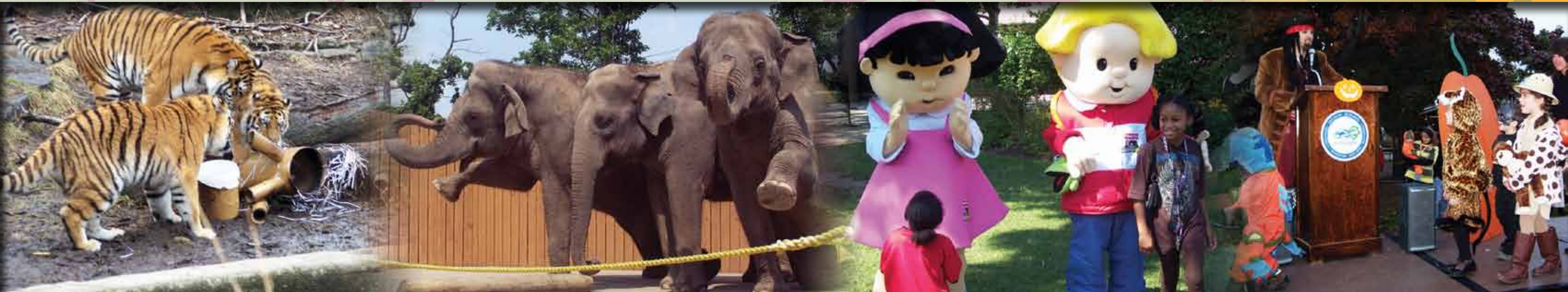
Our tigers received enrichment during Cool Cats Weekend.

The annual Breakfast With Santa event was held on December 12, 13, 19 and 20. Tickets included a buffet breakfast provided by CJ's Catering, prizes for the children, admission to the Zoo and a chance to visit with Santa. The event was extremely popular again this year and was nearly sold out.