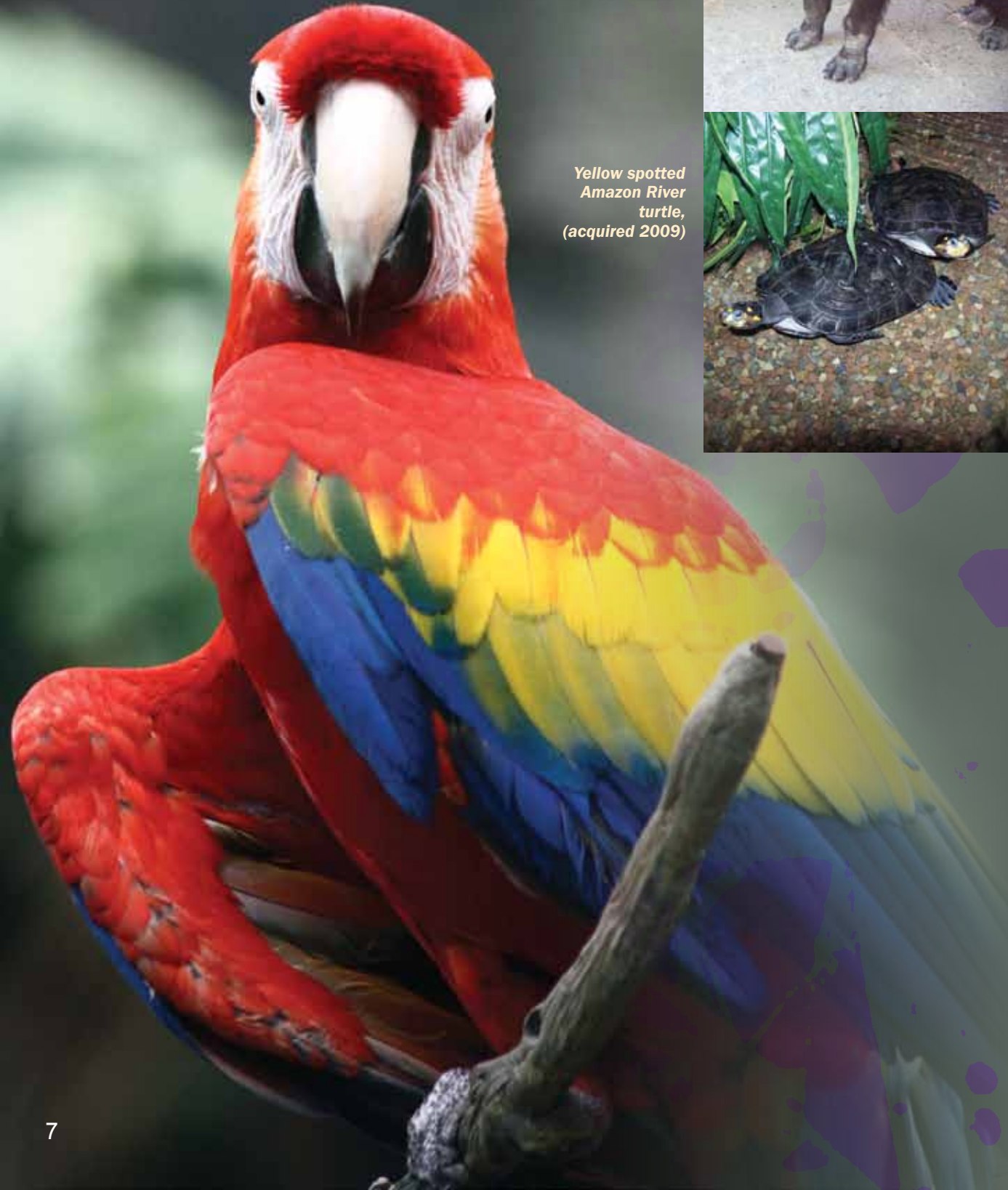
Scarlet macaw (acquired 2009)