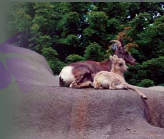
Bighorn sheep (born 2009)

Mandarin duck, cape teal, Edward's lorikeet, Forsten's lorikeet, blue-crowned motmot, matamata turtle, Asian water dragon, southern fence lizard, Virgin Islands boa, olive python, Japanese giant salamander, golden mantella, scorpion, goliath bird-eating tarantula, centipede